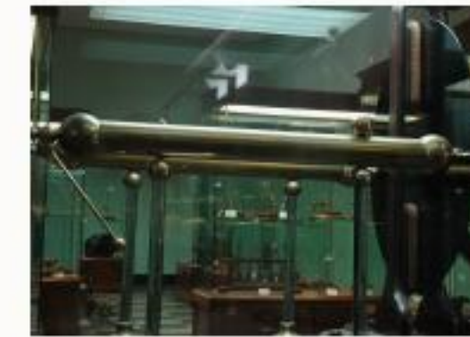
Ramsdem electric machine

Blas Cabrera Felipe is considered the father of physics in Spain. There are different displays dedicated to meteorology, optics, electricity and electromagnetism, sound, mechanical energy and heat, chemistry, agriculture and farming techniques. There are great collections of scientific apparatus: Ramsdem electric machine, voltaic batteries, etc.