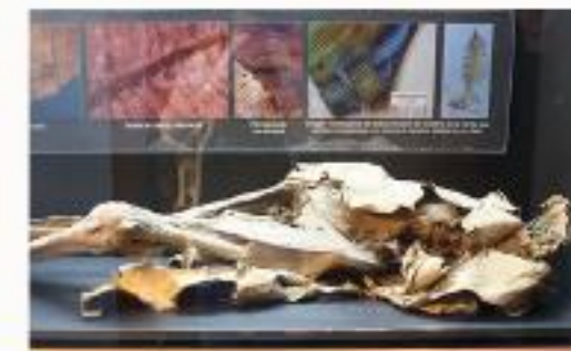
Female Guanche mummy

This cabinet contains pottery and mill stones used to grind cereals, a collection from the funds of the University of San Fernando: bones used by the medicine students, and a female mummy.