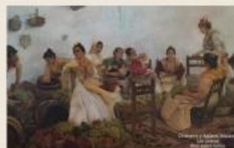
The Wine Grapers