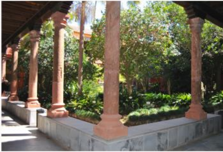
Cloister: volcanic stone columns with classical style capitals surrounding a beautiful garden.

This is the most important Renaissance cloister in the Canary islands. In the garden, there are many endemic plants. Until 1812 monks and important people from La Laguna were buried here. D. Miguel de Unamuno, the Spanish novelist wrote about this cloister after his visit in 1910: