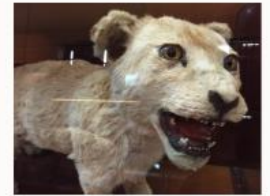
Lion ( Panthera Leo )